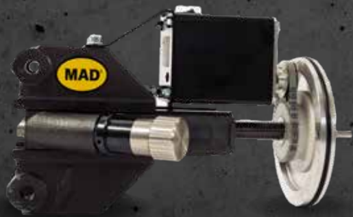
DISC ALIGNER SEMI-AUTOMATIC