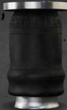
SLEEVE AIR SPRINGS