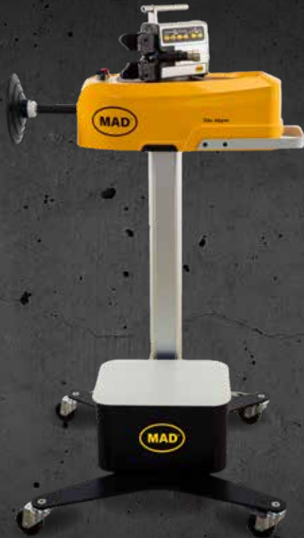
ON CAR BRAKE DISC ALIGNING UNIT