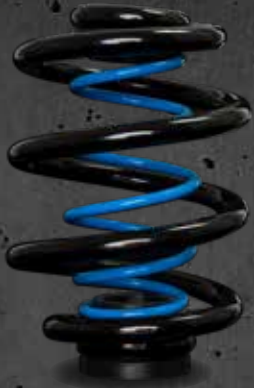
AUXILIARY COIL SPRINGS