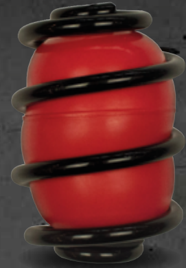
AUXILIARY AIR SPRINGS