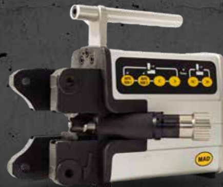
DISC ALIGNER AUTOMATIC