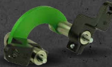
UNIVERSAL ADAPTER FITS ON ALMOST EVERY CAR