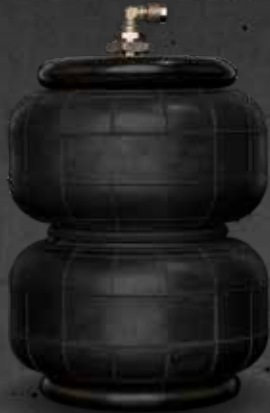
CONVOLUTED AIR SPRINGS