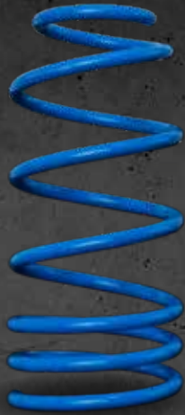
REINFORCED MAIN SPRINGS